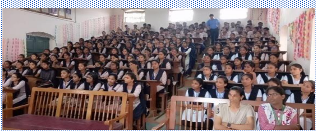
Vignettes from the programme organized by DLSA Vizianagram, Andhra Pradesh

On 04.07.2023, DLSA Pathanamthitta, Kerala, organized an Awareness Program on "Drug Abuse" at Holy Angels Model School, where Secretary, DLSA addressed around 120 students and teachers. She also told them about the "NALSA (Legal Services to the Victims of Drug Abuse and Eradication of Drug Menace) Scheme 2015".