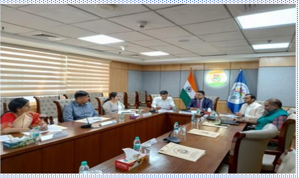
Vignettes from programme organized by Delhi SLSA for Principle Magistrates, JJBs

On 20.09.2023, Delhi SLSA, organised a Training Program for lawyers of the Rape Crisis Cell run by Delhi Commission For Women at Conference Hall, Rouse Avenue District Court Complex, New Delhi, where Ld. Member Secretary and Special Secretary, DSLSA addressed the participants on the topics "Way to Proceed for Adult Trial in POCSO Cases under J.J. Act" and the Delhi Victims' Compensation Scheme- 2018. The program saw participation of 48 lawyers of the Rape Crisis Cell.