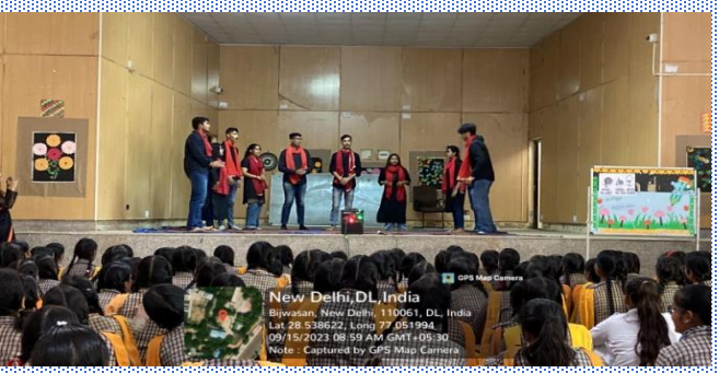
Vignettes from the programme organized by DLSA South-West, Delhi