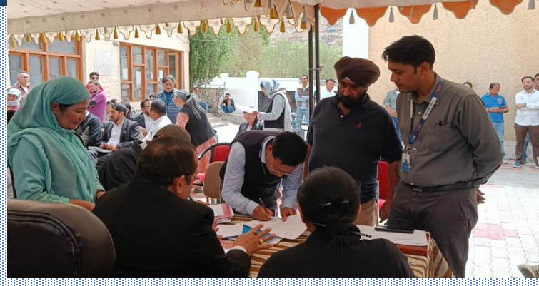
Vignettes from Meghalaya