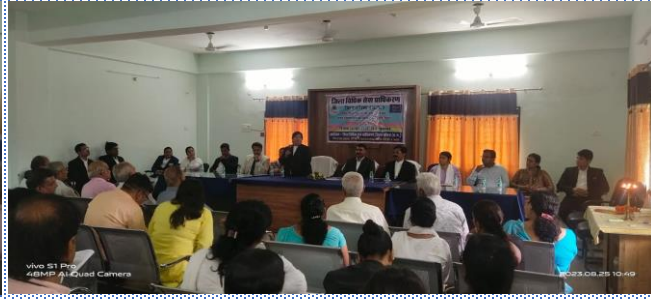
Vignettes from the programme organized by DLSA, Janjgir, Chhattisgarh

27.07.2023, Andhra SLSA Pradesh International Justice collaboration with (IJM) and Navjeevan NGO, organised a Legal Awareness programme on Human Trafficking and the legal provisions pertaining to the same. The participants in the programmes were also informed the Government schemes and Victim Compensation Schemes meant for the Victims of Ld. Member Secretary, APSLSA participated in the workshop organised to observe World Day against Trafficking in Persons.