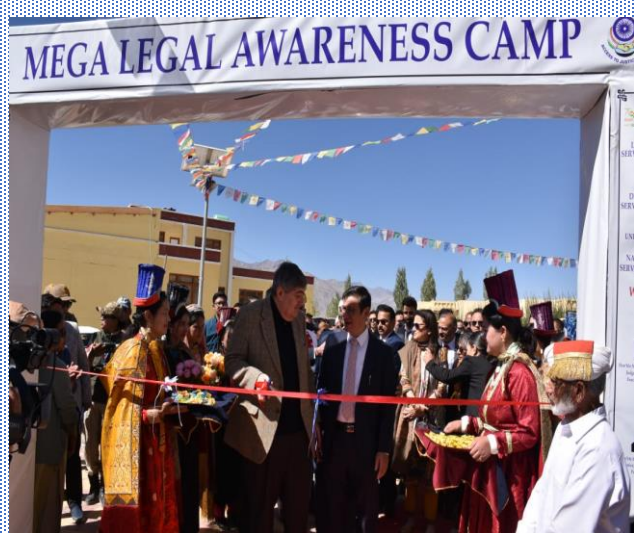
Vignettes from the Mega Legal Awareness Camp at Leh