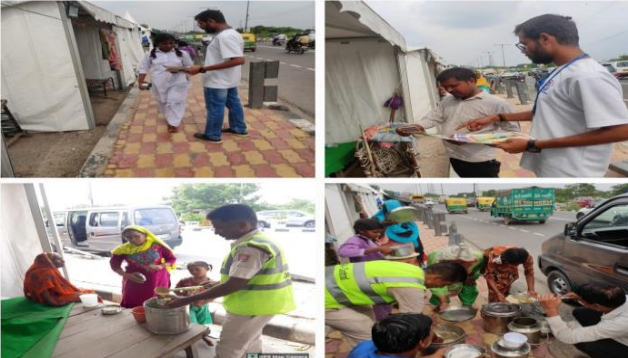
Vignettes from the programme organized by DLSA, Central District, Delhi

On 29.09.2023, DLSA, Senapati, Manipur, organized an interaction program with the families of victims of the violence in Manipur at the DLSA office. Interaction was done with around 14 families who had borne the brunt of the violence. They were informed about the provisions of the Manipur Victims' Compensation Scheme, 2019 and other forms of legal aid and assistance.