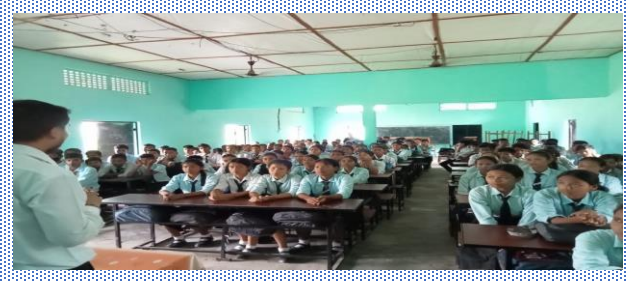
Vignette from the programme organized DLSA, Gologhat (above) Vignette from the programme organized by Sikkim SLSA (below)