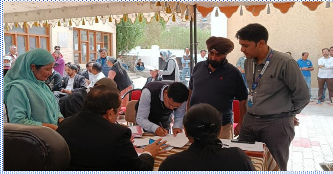
Vignettes from Ladakh