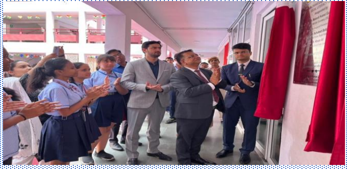
Vignette from the programme organized by DLSA New Delhi District, Delhi

On 17.08.2023, DLSA, New Delhi opened a Legal Literacy Club in Bloom Public School, in the august presence of the Ld. Member Secretary, DSLSA and other Secretaries. DSLSA Information Board was also inaugurated there. Students were informed about the different services provided by DSLSA under the aegis of NALSA and the Toll-Free No. 1516 and 15100. Around 90 students attended the event.