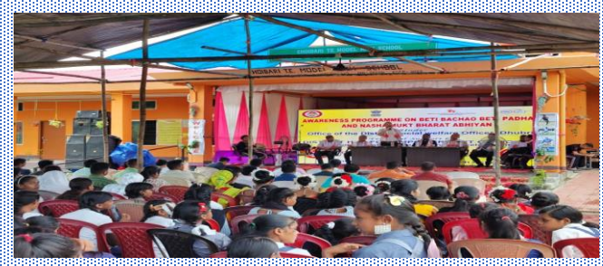
Vignettes from the programme organized by DLSA, Dhubri, Assam