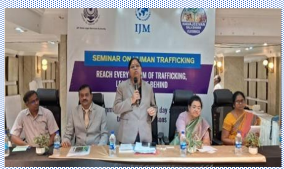
Vignette from the programme organized by Andhra Pradesh SLSA

27.07.2023, Andhra SLSA Pradesh International Justice collaboration with (IJM) and Navjeevan NGO, organised a Legal Awareness programme on Human Trafficking and the legal provisions pertaining to the same. The participants in the programmes were also informed the Government schemes and Victim Compensation Schemes meant for the Victims of Ld. Member Secretary, APSLSA participated in the workshop organised to observe World Day against Trafficking in Persons.