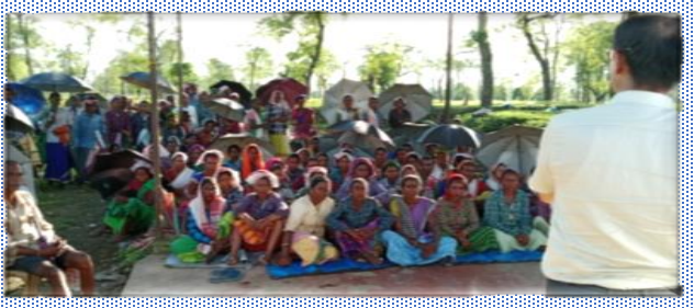
Vignettes from the programme organized by DLSA Sonitpur, Assam

On 15.07.2023, Meghalaya State Legal Services Authority, organised a Mega Camp-cum-Awareness Programme on the theme "Bridging the Gap", where people were informed about "NALSA and Government- Welfare Schemes". The Camp was organised at St. Francis De Sales Secondary School, Somonpara under Gambegre, Community and Rural Development Block, West Garo Hills district. To celebrate 25 years of legal aid services in Meghalaya, a project funded by the Department of Justice, titled "Increasing Access to Justice through Community Mediation" was also launched, whereunder the headmen or village court under District Council or Nokmas will be given special Mediation Training and would also be made to understand formal laws.