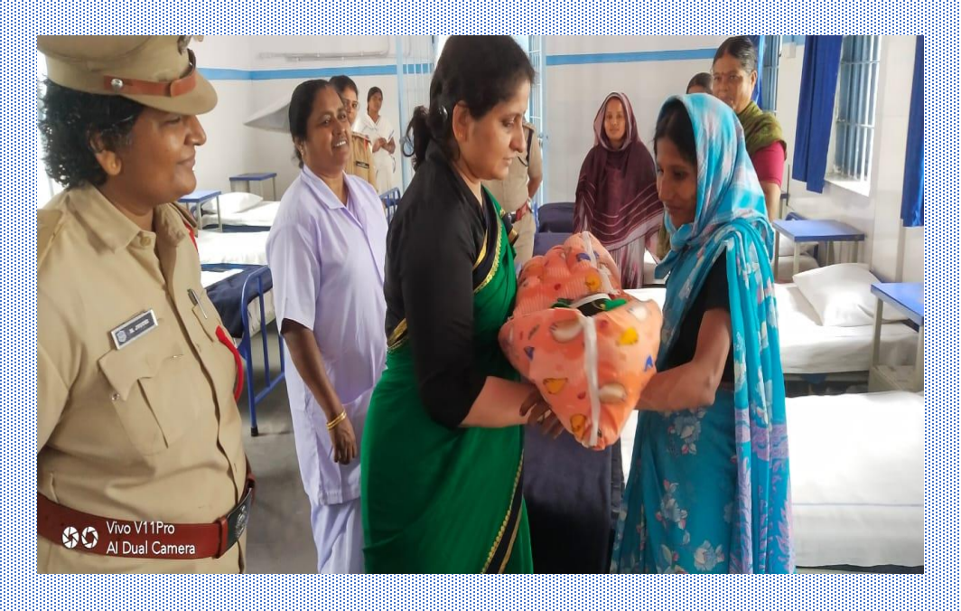
Vignettes from the programme at Special Prison for women, Chanchalguda, Hyderabad (right)

On 23.09.2023, the Secretary, District Legal Services Authority, Hyderabad visited the Special Prison for Women at Chanchalguda, Hyderabad and addressed the inmates on the topic NALSA (Victims of Trafficking and Commercial Sexual Exploitation) Scheme, 2015. She also informed them about the victims' compensation scheme.