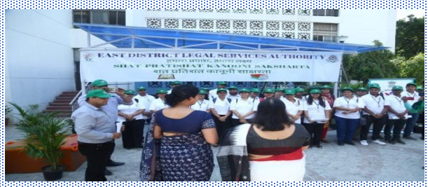
Vignettes from the programme organized by DLSA East, Delhi